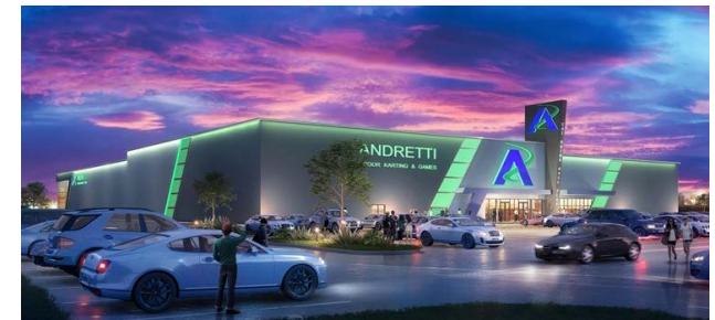
Andretti Indoor Karting 90,000 SF sports hub with karting, video arcades, VR games, & more