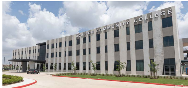
Houston Community College Katy Campus 124,000 SF with ±4,300 Students