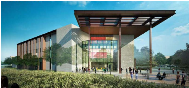
University of Houston Victoria at Katy Campus 10,000+ Students

In Katy ISD, with projected student enrollment of 100K+ by 2028.