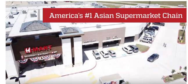
Katy Asian Town H-Mart Anchored Development 100,000 SF of multicultural retail & dining options