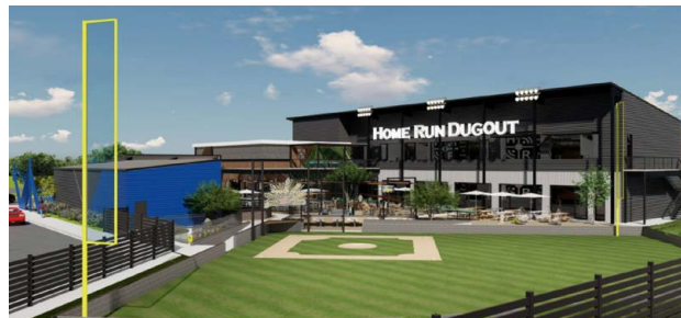
Home Run Dugout Batting Bays, Parties & Events + Restaurant & Bar