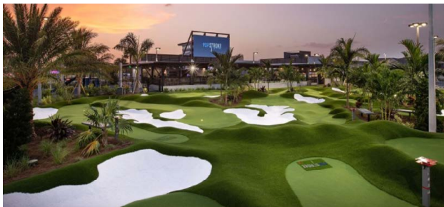
Popstroke Two 18-hole mini golf course concept by Tiger Woods